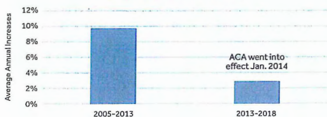
BA Auto Care Premium Increases