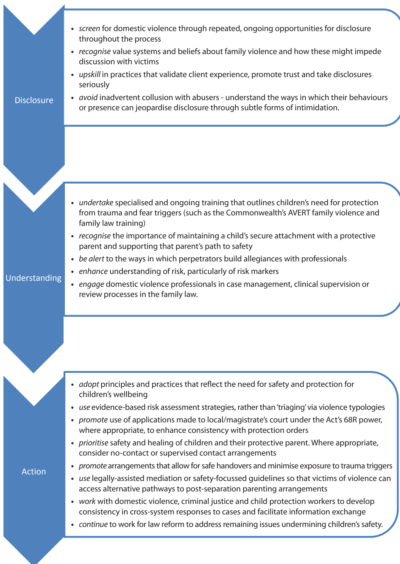
Figure 2: Practice Recommendations