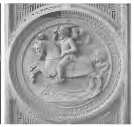
DEPARTMENT OF LEGISLATIVE SERVICES 2012