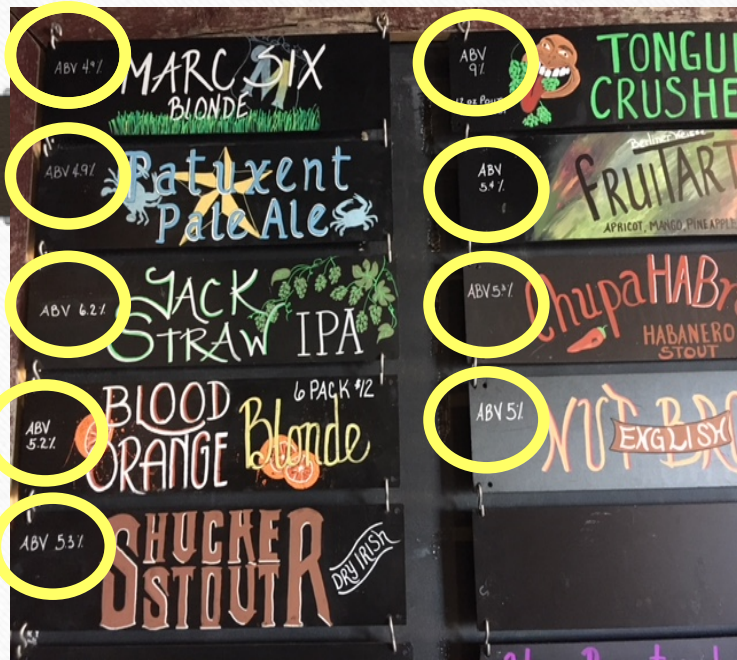
Menu Board In Mully's Tap Room