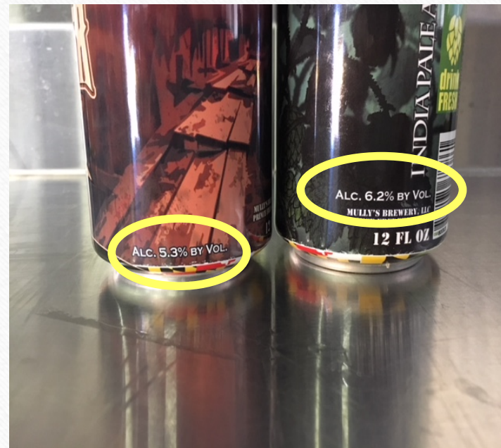
Mully's Packaged Beer