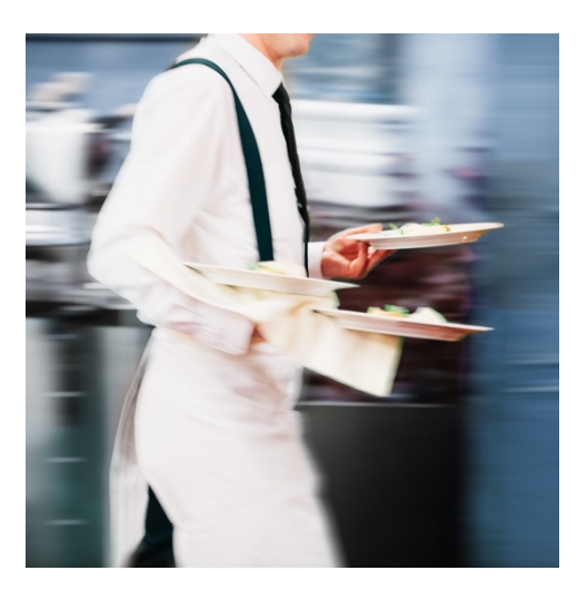
We are the largest foodservice trade association in the world.

Founded in 1919, the National Restaurant Association's mission is to advance and protect America's restaurant and foodservice industry.