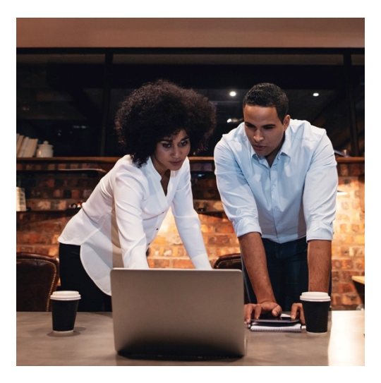
We have operators interests in mind, we vet tools and resources to take the burden off of members and ultimately make them more successful.