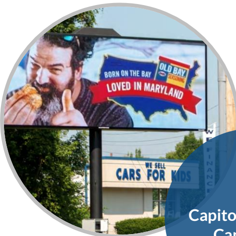
Capitol Billboard Campaign

A Digital Billboard at the Bay Bridge will allow MSDE to reach Maryland residents and tourists on the way to Ocean City.