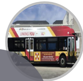
Utilizing MTA Light Rail, Buses, and Metro.